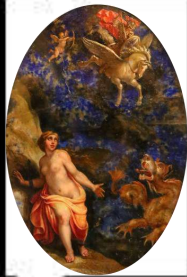
Room XIX Pegasus