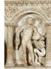
Room II Hydra