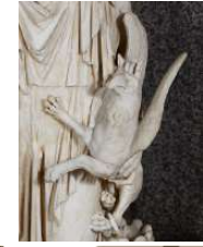
Room III Griffin