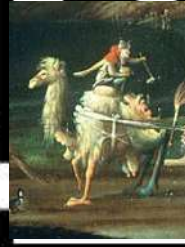
Room X Plumed camel