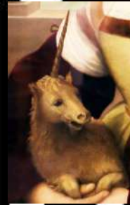
Room IX Unicorn