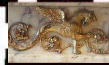
Room XI Capricorn